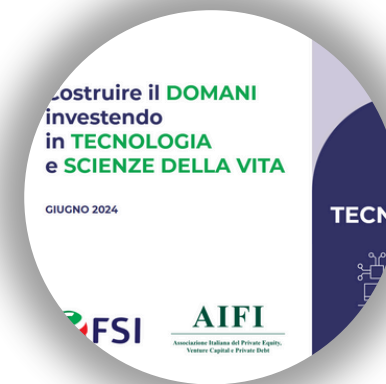
Costruire il domani investendo in tecnologia e scienze della vita