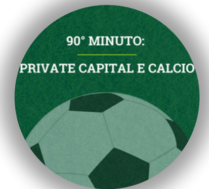
90 minuti: private capital e calcio