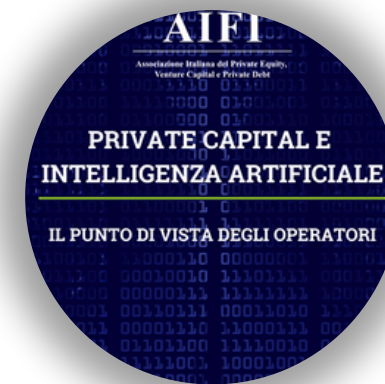
Private Capital e Intelligenza Artificiale