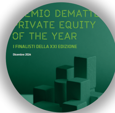
Private Equity of the Year - I finalisti della XXI edizione