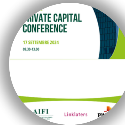
Private Capital Conference