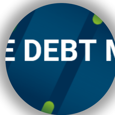
Private Debt Market