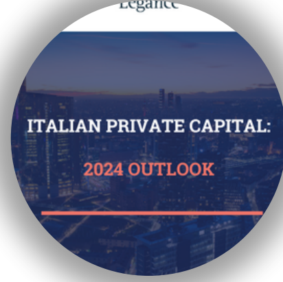
Meeting in London