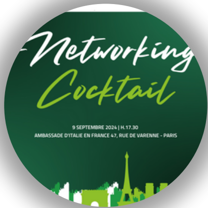
Meeting in Paris