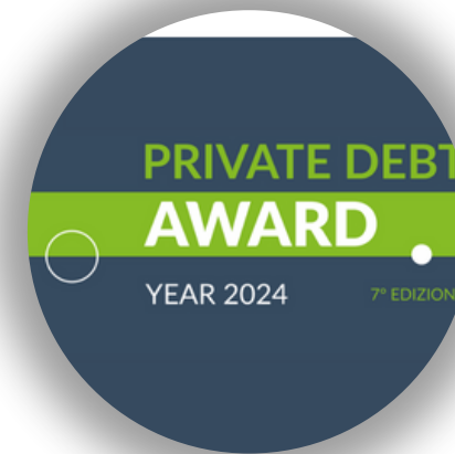
Private Debt Award