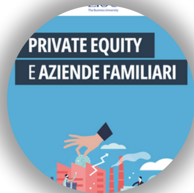
Private Equity e Aziende Familiari