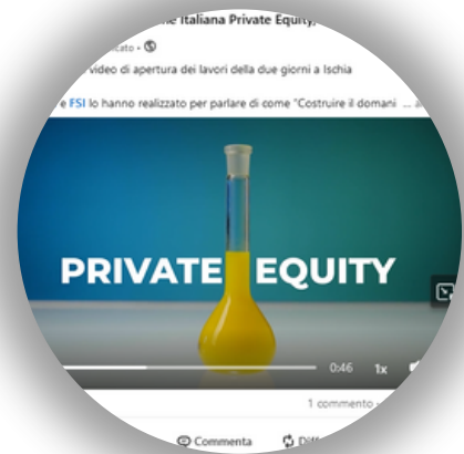
Reels and videos