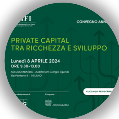
AIFI Annual Meeting