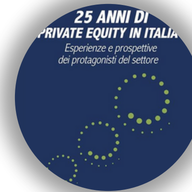
25 anni di private equity in Italia