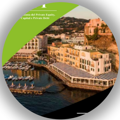
Meeting with Italian Institutional Investors