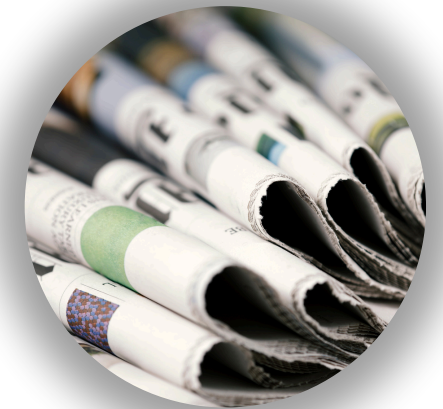
Press Office Activities