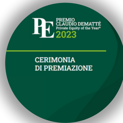
Premio Dematté PEYO