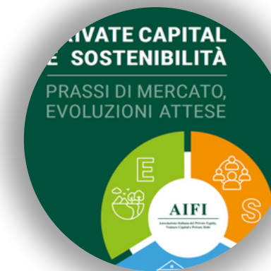
Private Capital e Sostenibilità