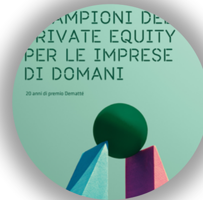
Storytelling on private equity champions