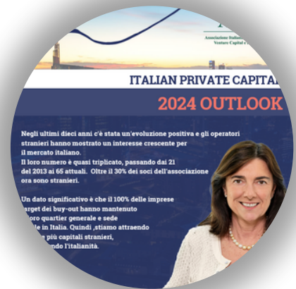
Social Card on LinkedIn