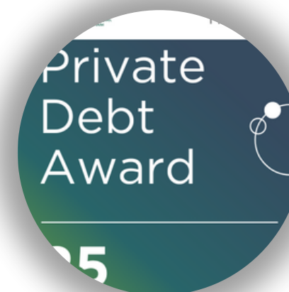
Private Debt Award