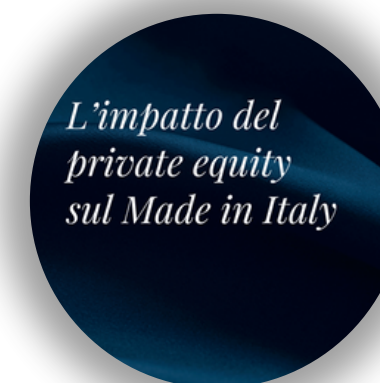
L'impatto del Private equity sul Made in Italy