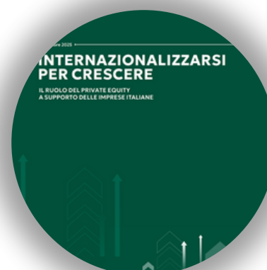
Internazionalizzarsi per crescere