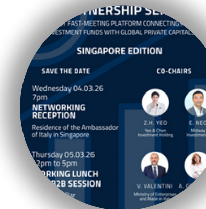
Meeting in Singapore