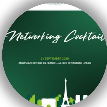
Meeting in Paris