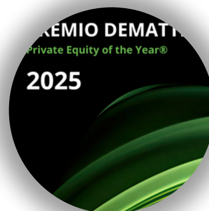
Premio Dematté PEYO