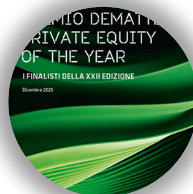
Private Equity of the Year - I finalisti della XXII edizione