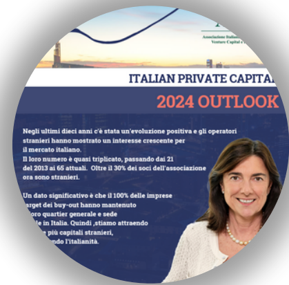
Social Card on Linkedin and Instagram