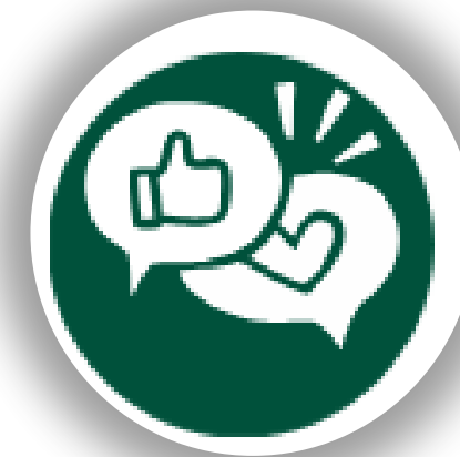
Other Social Media Activities