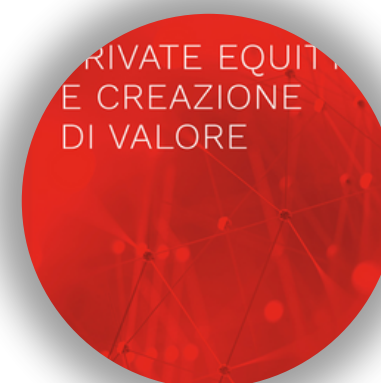
Private Equity e Creazione di Valore