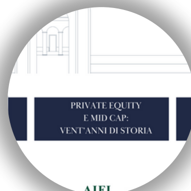
Private equity e mid cap: vent'anni di storia