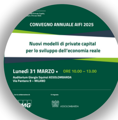
AIFI Annual Meeting