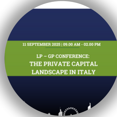
Meeting in London