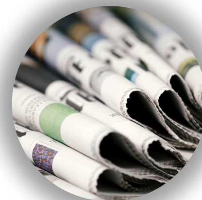
Press Office Activities