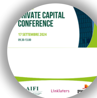
Private Capital Conference