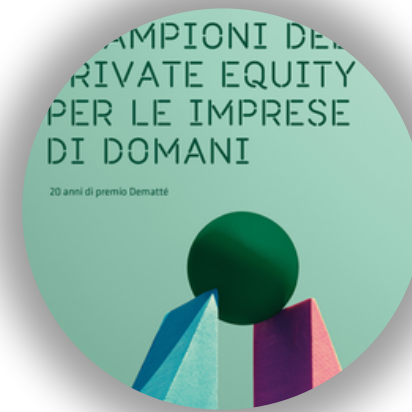
Storytelling on private equity champions