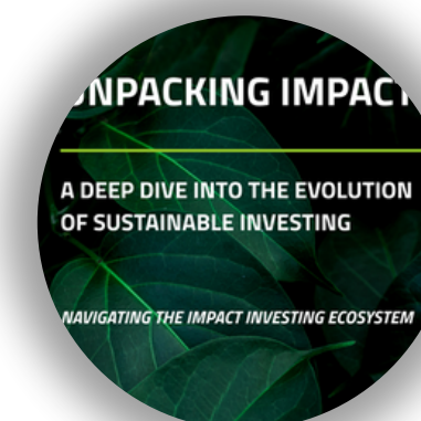
Unpacking Impact: a deep dive into the evolution of sustainable investing