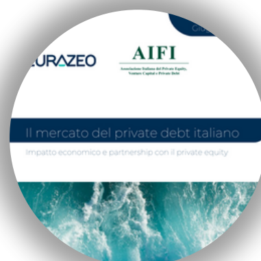
Il mercato del private debt italiano