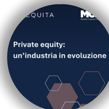
Private Equity: un'industria in evoluzione