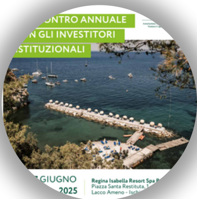
Meeting with Italian Istitutional Investors