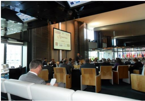
EBRD board room London

Seed Forum has organized more than 250 investor match-making forums in 25 countries