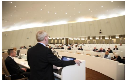
Parliament Bosnia-Herzegovina- Sarajevo