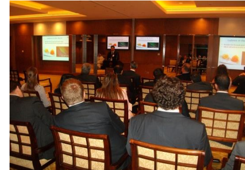
Emirate Palace Abu Dhabi